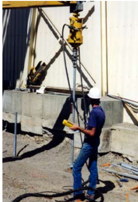
Helical piers for new industrial park.

Installed laterally as tie-backs or anchors, they are used for shoring in new construction, slope stabilization, utility anchors, and to stabilize and restore walls that have been improperly constructed or damaged by poor drainage or expansive soils.