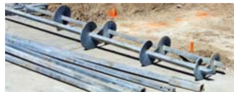
Helical piers ready for installation.