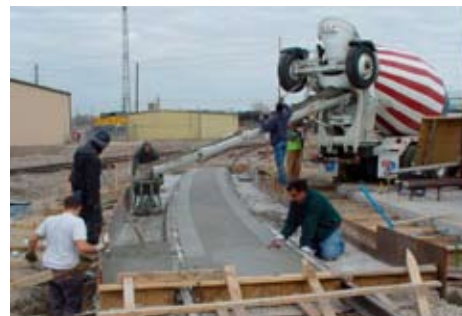
Stage 3: Sara Lee Bakery - GJ, CO