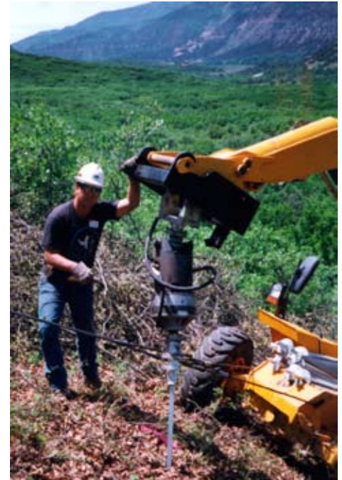
Helical piers for new 12" water line located on a mountain slope, approximately 1,400 ft. above valley floor. --- Paonia, CO.