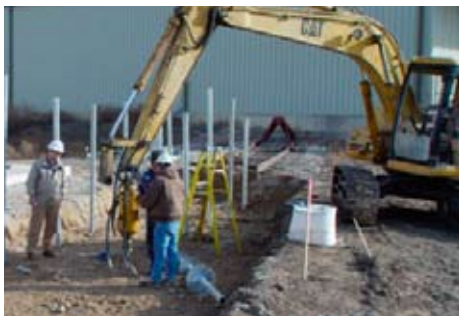
Stage 1: Sara Lee Bakery - GJ, CO