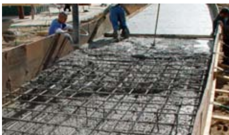
Stage 2: Sara Lee Bakery - GJ, CO