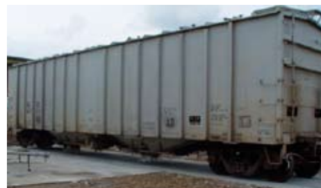
Finished: Sara Lee Bakery - GJ, CO